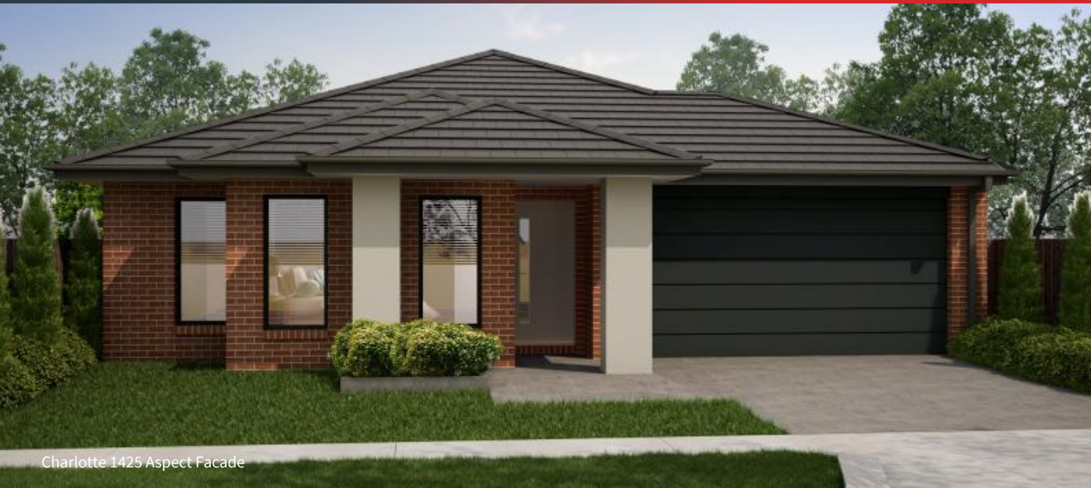
Charlotte 1425 Aspect Facade