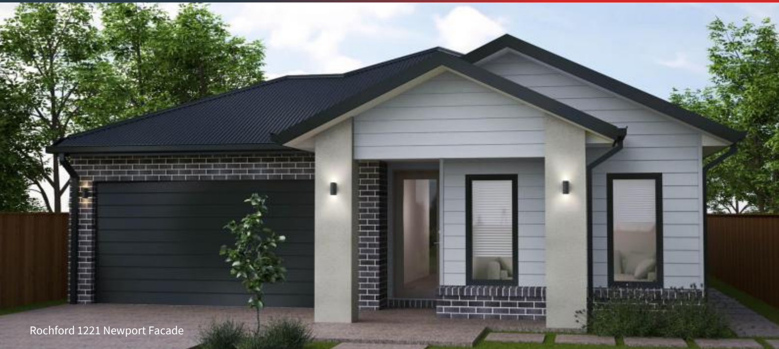
Rochford 1221 Newport Facade

LOT 1643 ZION PARADE , EVERGREEN , CLYDE HOME SIZE - 22sqsq LAND SIZE - 350m2