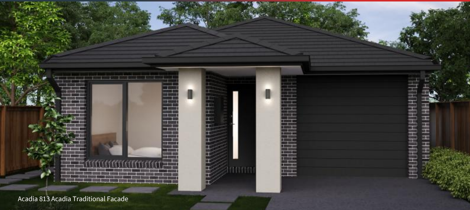
Acadia 813 Acadia Traditional Facade

LOT 1108 MALHAM STREET , AUSTIN , LARA HOME SIZE - 13sqqs LAND SIZE - 238m2