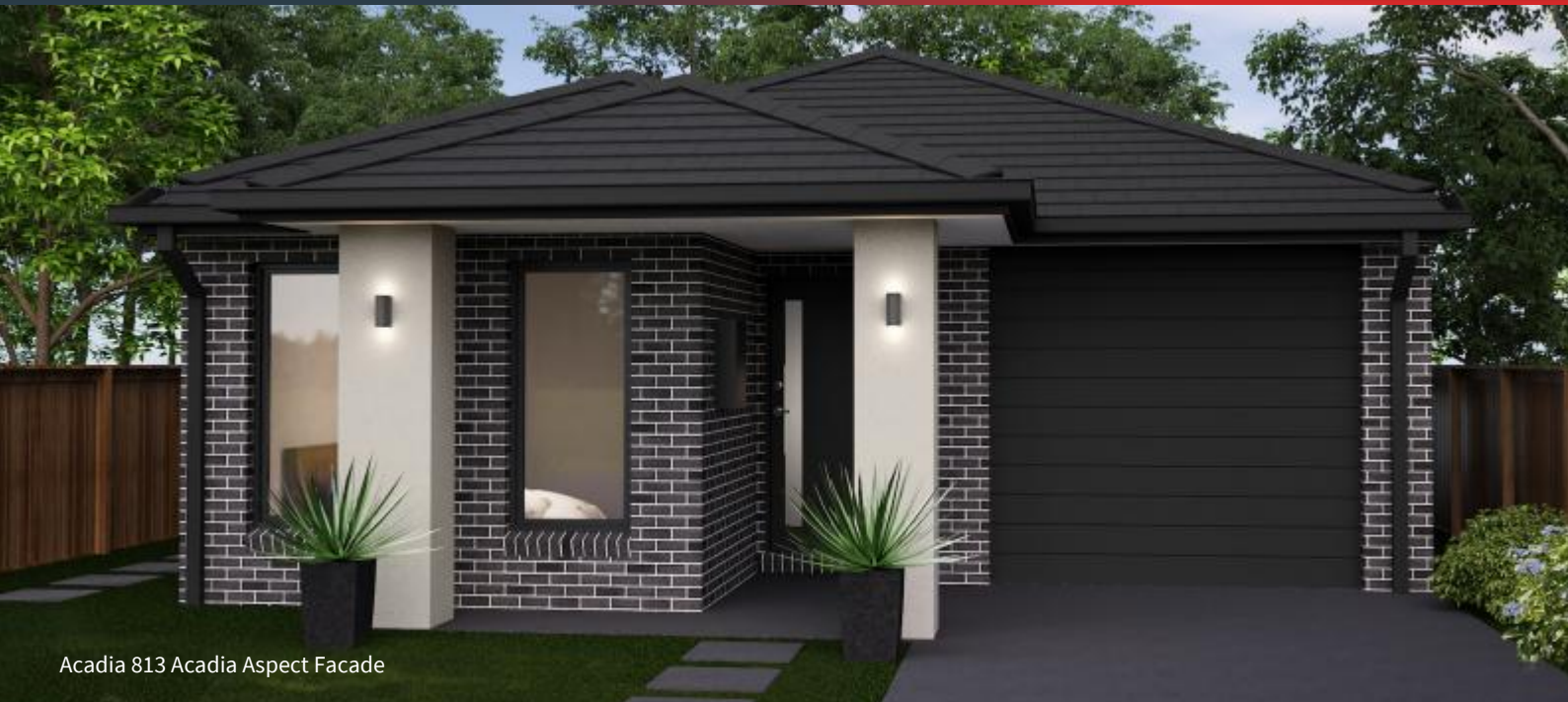
Acadia 813 Acadia Aspect Facade

LOT 341 SUMAC STREET , EVERTON , BROOKEFIELD