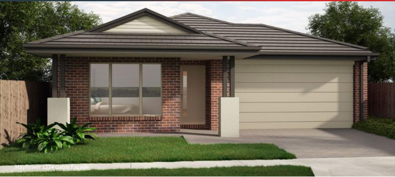
Mayflower 1224 Gable Facade

LOT 531 SELBOURNE STREET , THE MILLSTONE , STRATHTULLOH