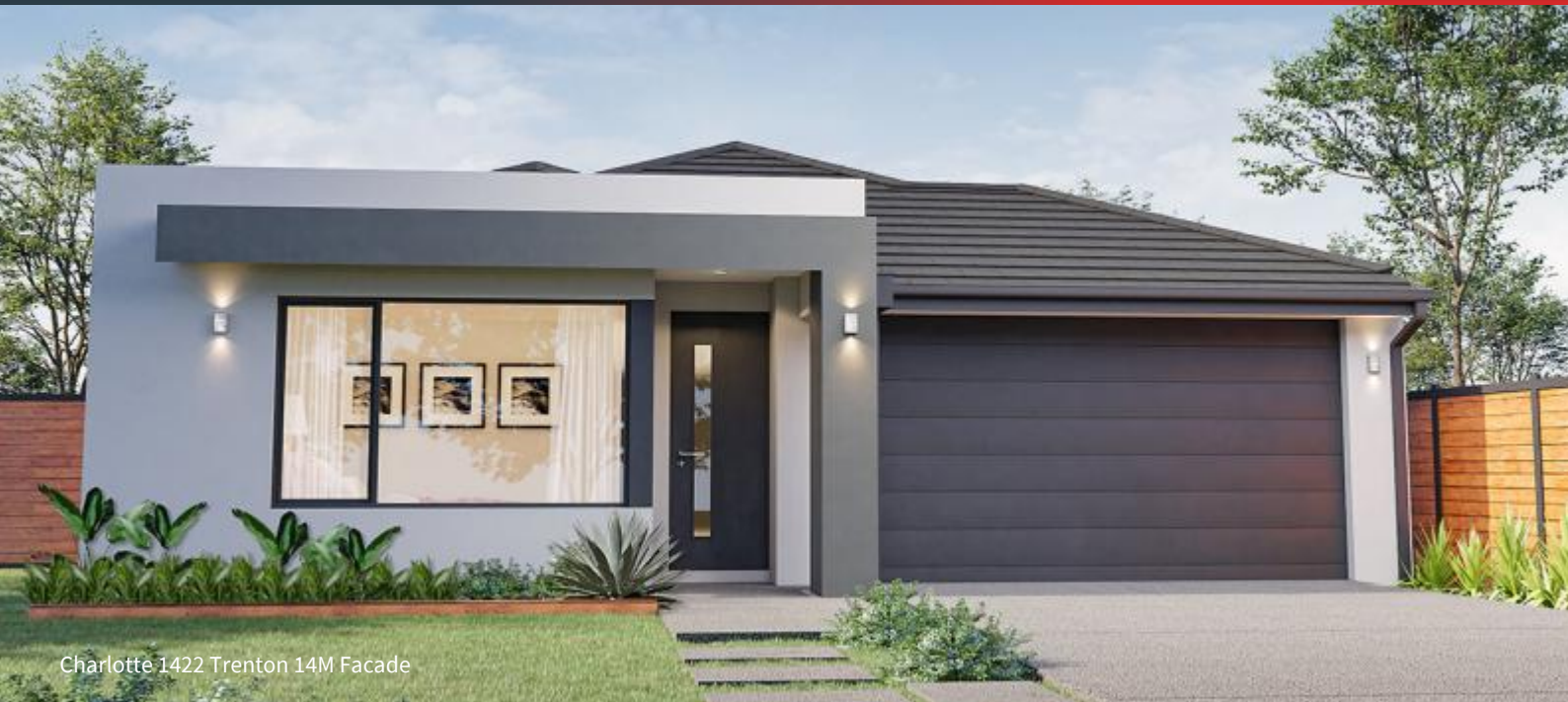
Charlotte 1422 Trenton 14M Facade

LOT 119 VERBENA BLVD , ONE BELLS , CLYDE