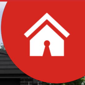
Acadia 813 Facade

LOT 715 RENAISSANCE DRIVE , THE MILLSTONE , THORNHILL PARK HOME SIZE - 13sqs LAND SIZE - 190m2 PACKAGE PRICE