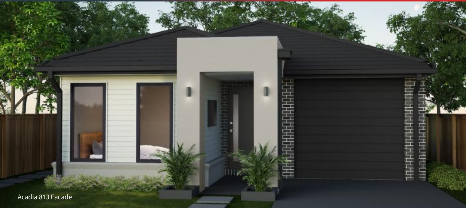
Acadia 813 Facade

LOT 1715 KASHMIR STREET, CHARLEMONT RISE, CHARLEMONT