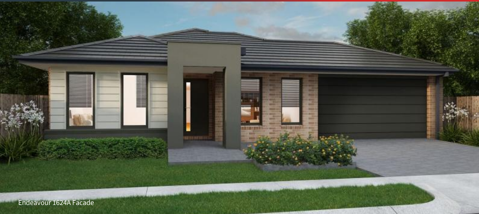
Endeavour 1624A Facade

LOT 105 CALLAGHAN STREET, BARLOW HILLS, EPSOM