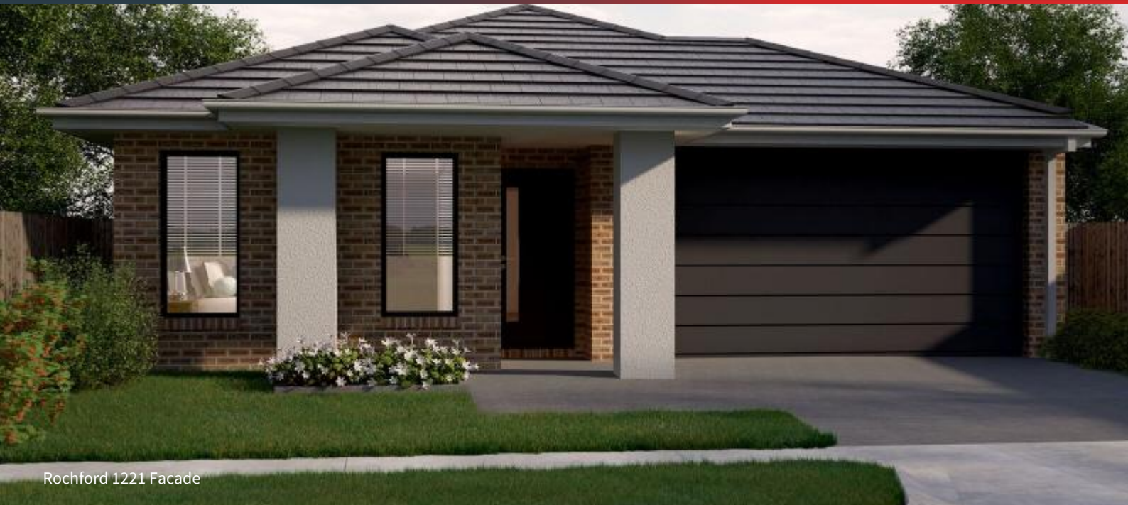
Rochford 1221 Facade

LOT 105 CALLAGHAN STREET, BARLOW HILLS, EPSOM