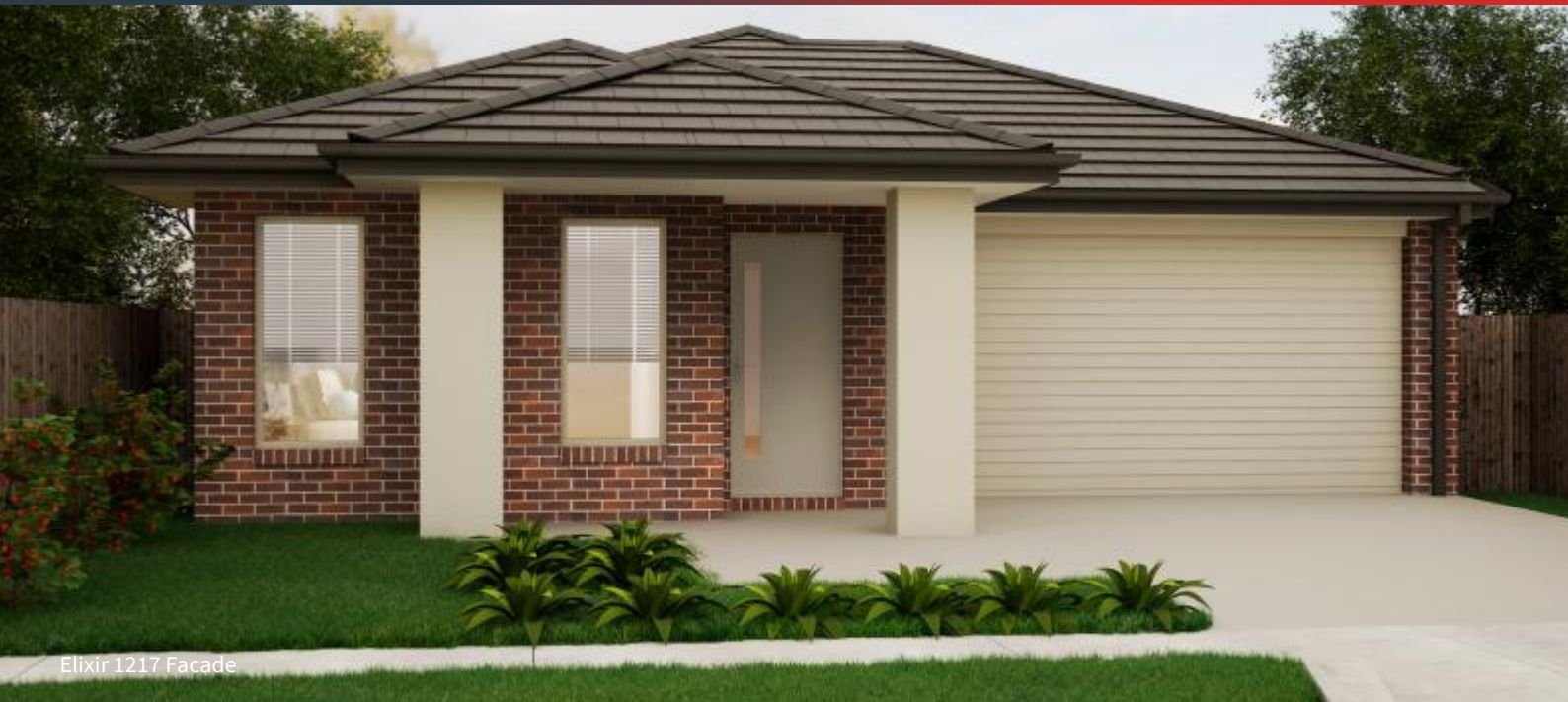
Elixir 1217 Facade

LOT 1135 TAHOE AVENUE , WINTERFIELD , WINTER VALLEY