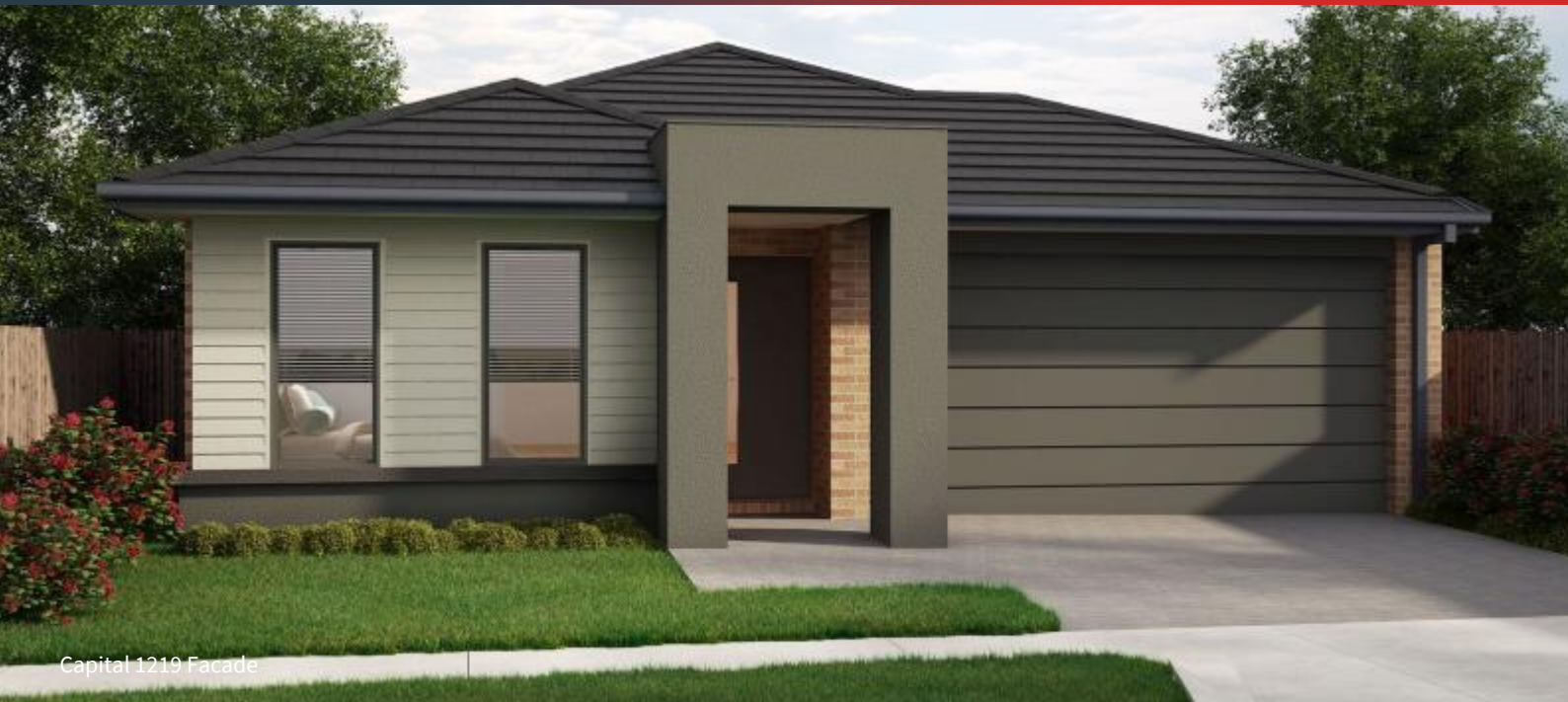
Capital 1219 Facade

LOT 1577 SELLS ROAD , LUCAS , BALLARAT HOME SIZE - 19sqs LAND SIZE - 452m2