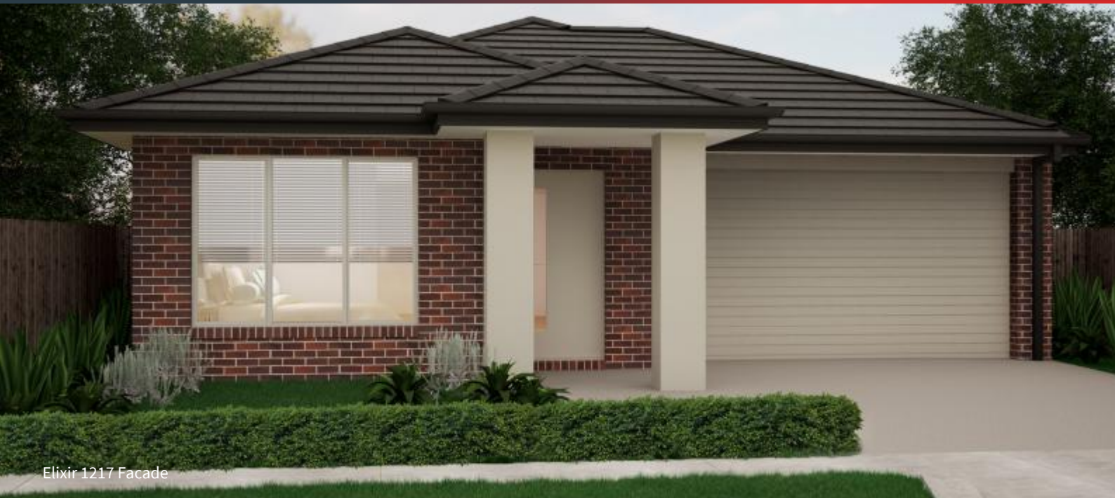
Elixir 1217 Facade

LOT 201 VERDALE DRIVE , ALFREDTON GROVE , BALLARAT