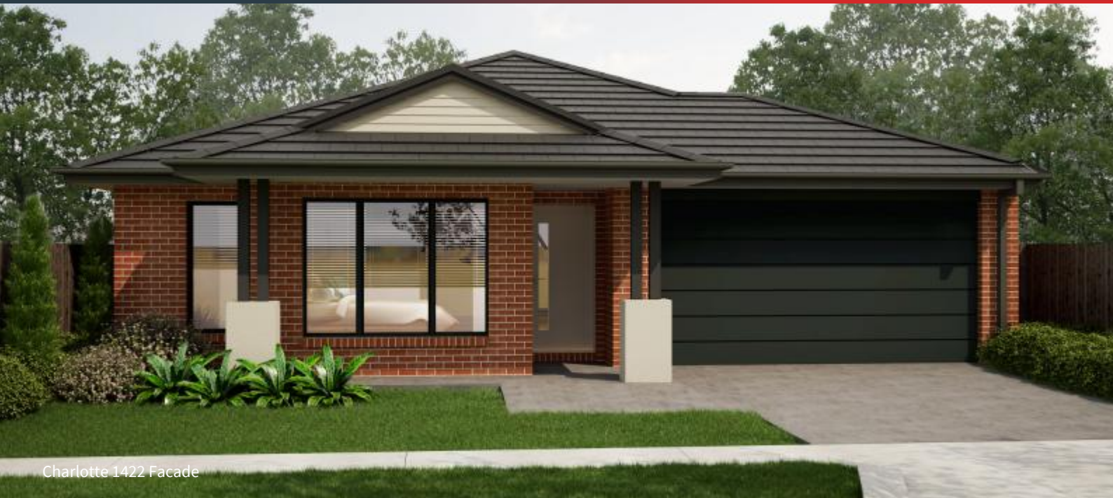
Charlotte 1422 Facade

LOT 34 NAME ROAD , REDBANK RISE , SEYMOUR HOME SIZE - 22sqs LAND SIZE - 810m2