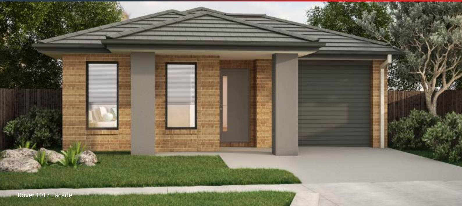
Rover 1017 Facade

LOT 33 NAME ROAD , REDBANK RISE , SEYMOUR HOME SIZE - 17sqs LAND SIZE - 821m2