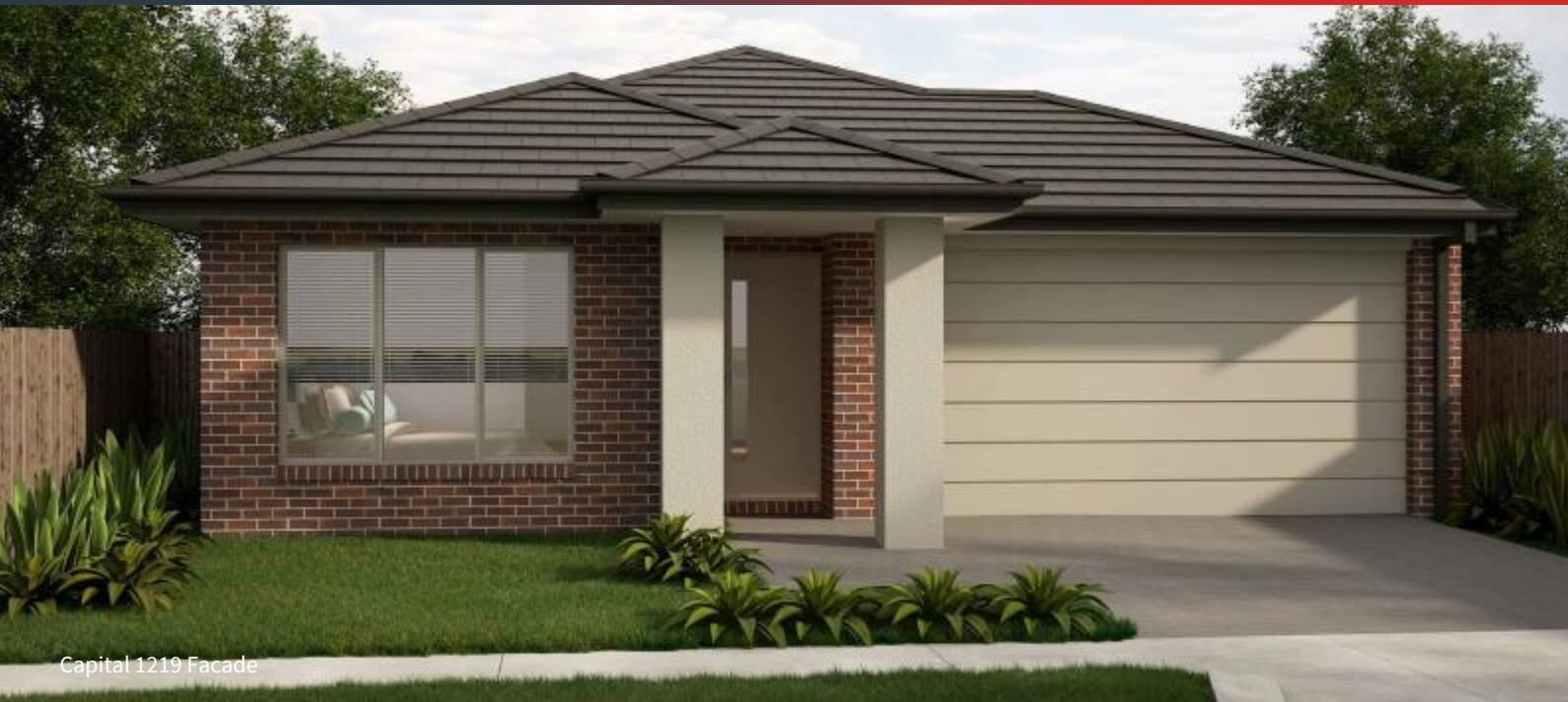
Capital 1219 Facade

LOT 30 NAME ROAD , REDBANK RISE , SEYMOUR